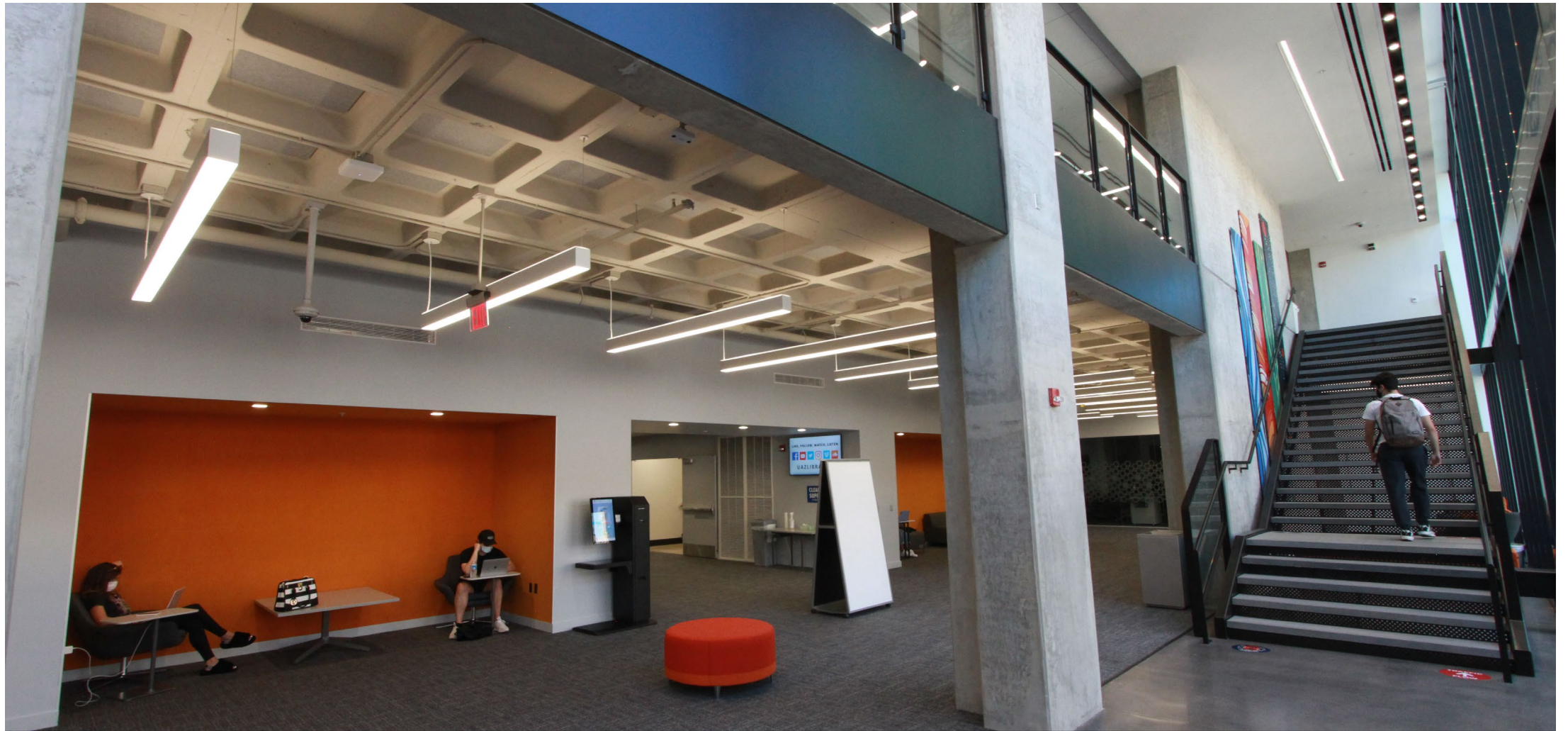
Albert B. Weaver Science-Engineering Library, 2nd floor (ground floor)

Renovations included adding another entrance on the east side of the building and redesigning two floors to focus on connecting library spaces with the collaborative classroom space.