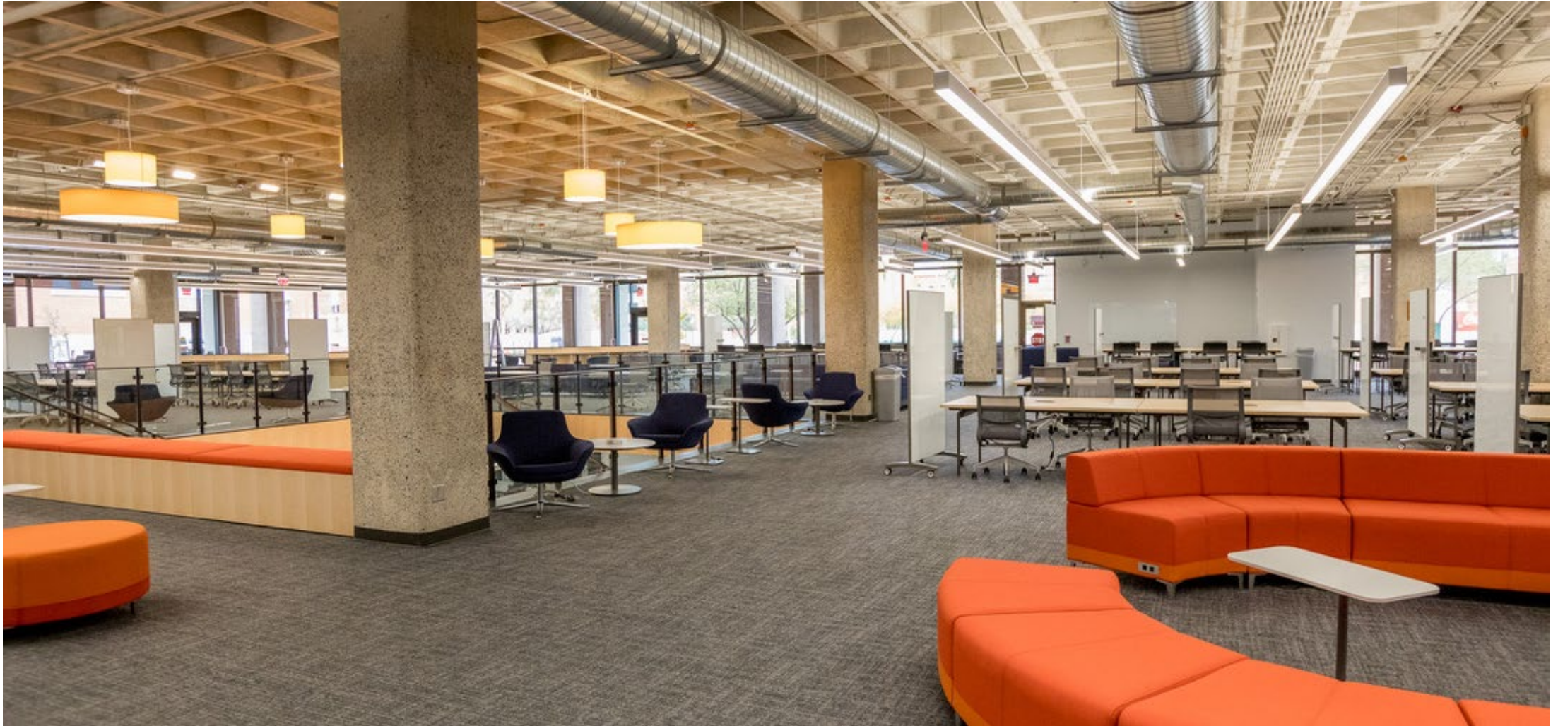
Main Library, 2nd floor (ground floor)

200+ study rooms can be reserved for groups or individual studying at Main and Weaver Libraries.