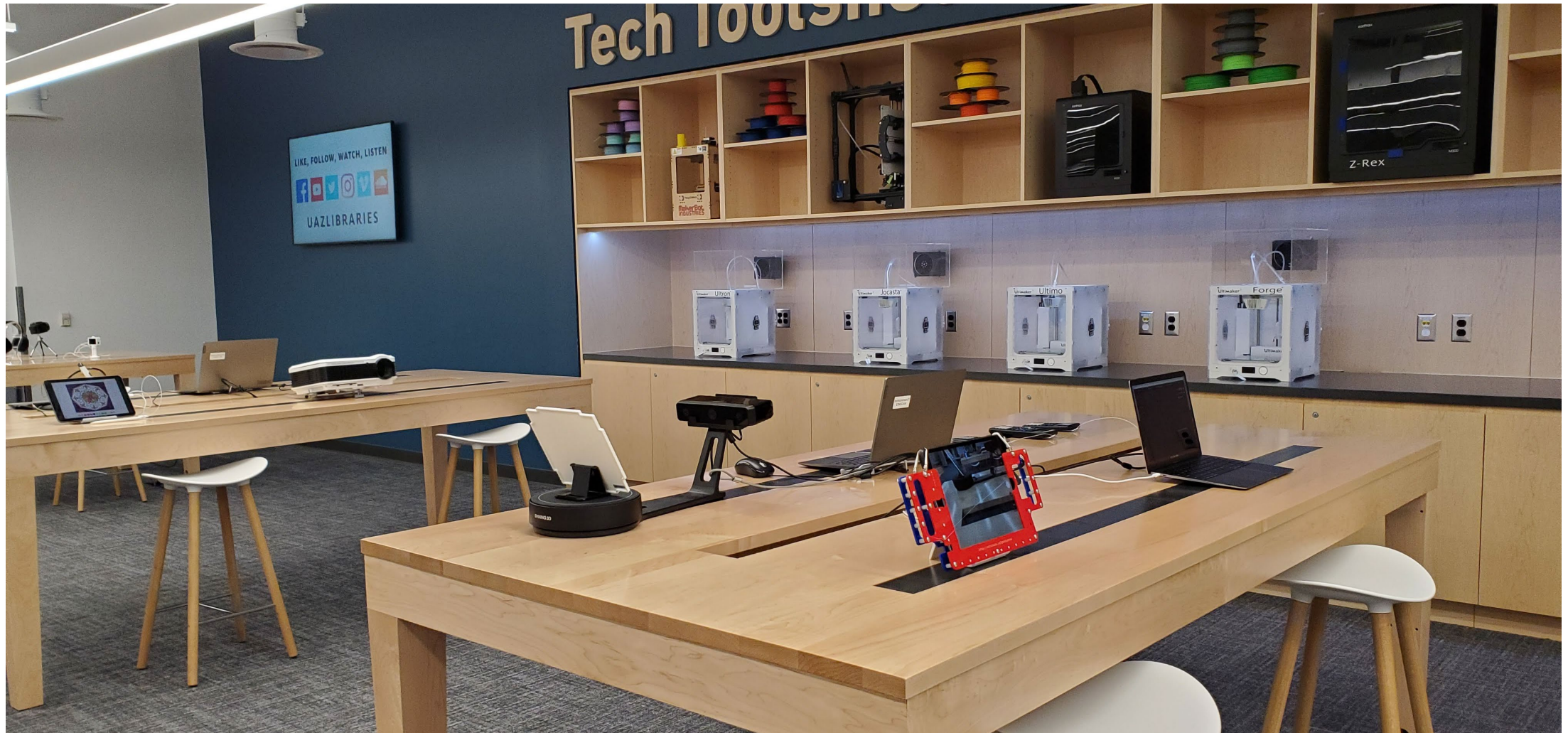
Main Library, 1st floor

Students can borrow 1,500 pieces of technology at the Tech Toolshed. The adjacent 24/7 Lounge and Multimedia Zone provide in-person IT help and access to special equipment and software.