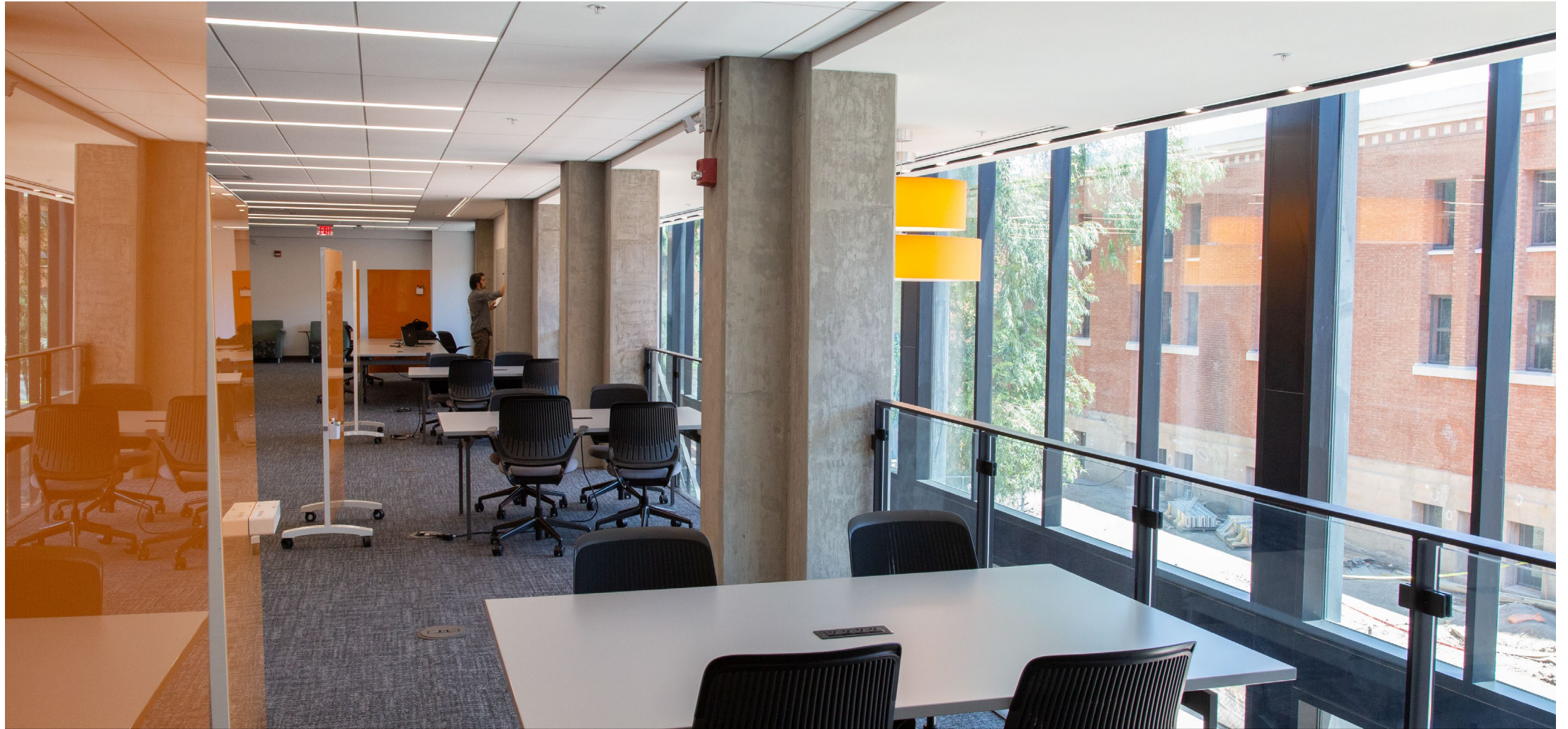
Albert B. Weaver Science-Engineering Library, 3rd floor

Students now have more study spaces where they can work alone, collaborate in groups, or meet with instructors.