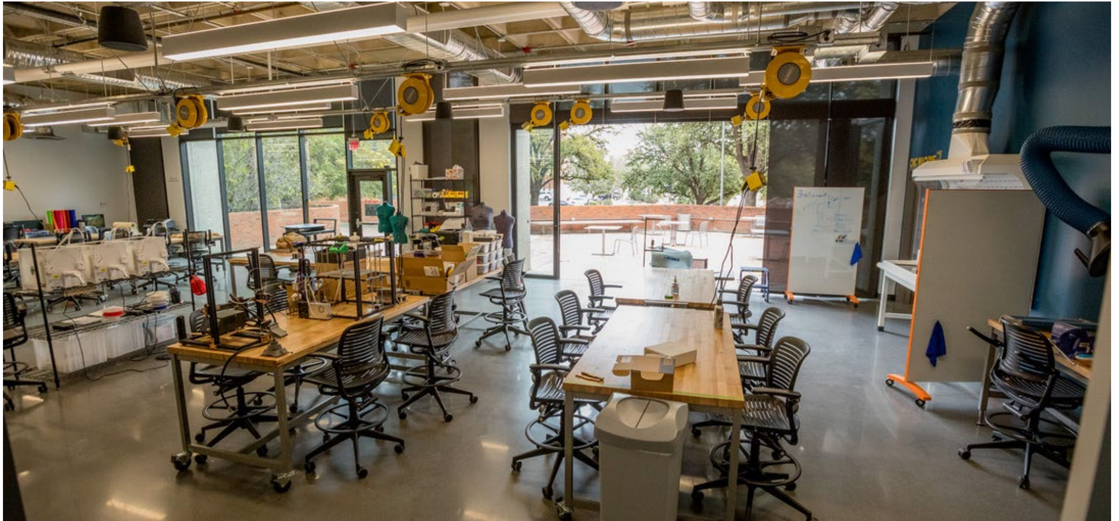
Main Library, 2nd floor (ground floor)

The CATalyst Studios is open to students from all disciplines, and includes a Maker Studio, a VR Studio, a Data Studio, and learning studios for instruction. Faculty and staff can take free classes and workshops as well.